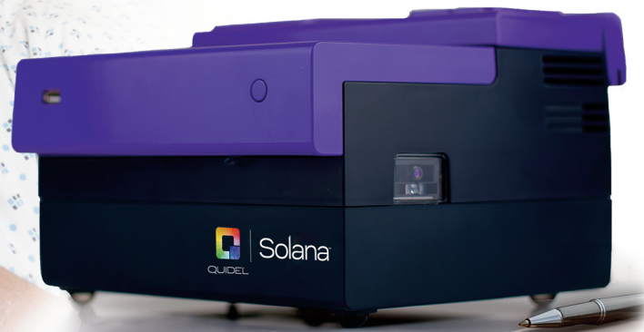
Solana Influenza A+B Assay run with the Solana bench top instrument a mere 9.4" x 9.4" x 5.9"

The Accurate. Sustainable. Molecular Flu Solution.