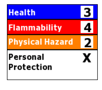
HMIS RATINGS (0-4)