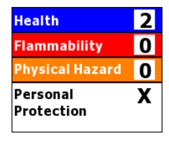
HMIS RATINGS (0-4)