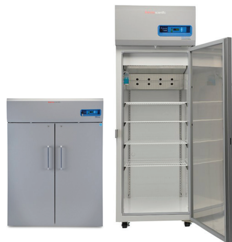
TSX Series refrigerator TSX5005SA

In addition to these energy-saving features, the TSX Series refrigerators use non-hydrofluorocarbon (HFC) coolants, which helps reduce environmental impact and further increases cooling efficiency. HFC coolants have been identified by the United States Environmental Protection Agency [1] and European Commission [2] as having significant global warming potential (GWP). So we are phasing out the use of these coolants in our freezers and refrigerators in favor of more environmentally friendly alternatives that also offer better cooling efficiency.