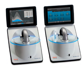
NanoDrop One/One<sup>c</sup> Improve sample confidence with contaminant identification and data integrity compliance