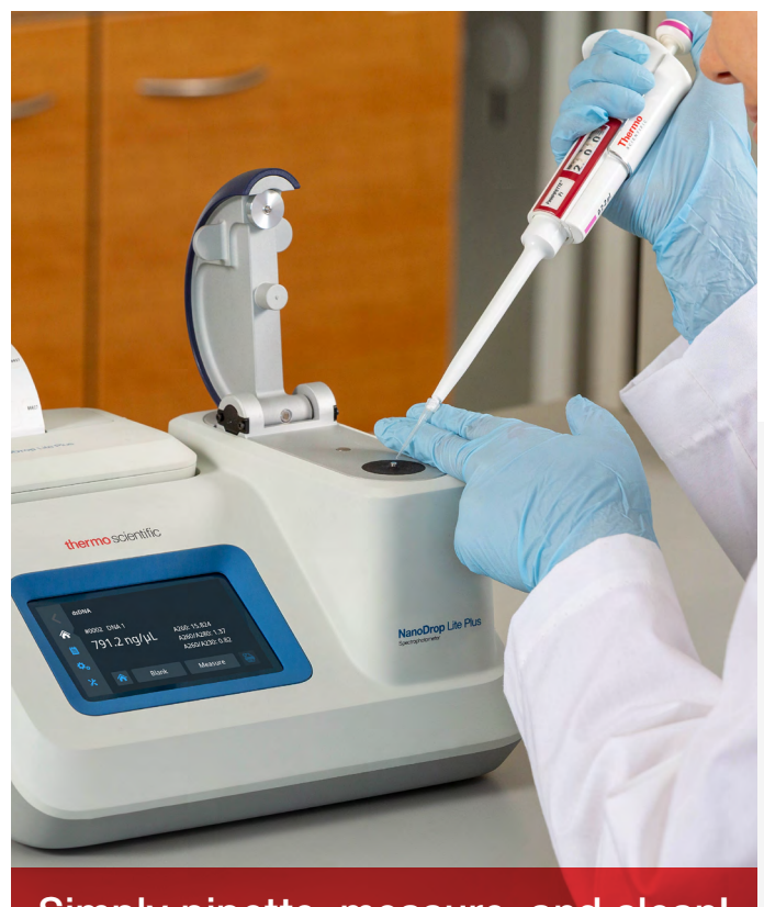
Simply pipette, measure, and clean!

The NanoDrop Lite Plus instrument is a valuable teaching tool and ideal for quality check measurements in busy research labs as well. The system measures purified DNA, RNA, and protein concentration up to 30 Abs and calculates critical A260/A280 and A260/A230 purity ratios. Our pioneering sample-retention technology eliminates the need to dilute highly concentrated samples making measurements easy. Simply pipette your sample directly onto the optical measurement pedestal, measure, and wipe clean. Built-in control simplifies operation, so even new users can quickly get results.