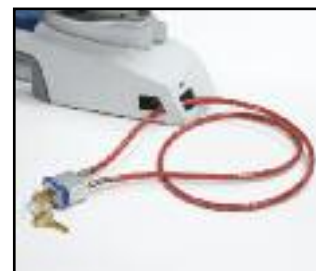
Security Device accessory (Lock & cable sold separately)