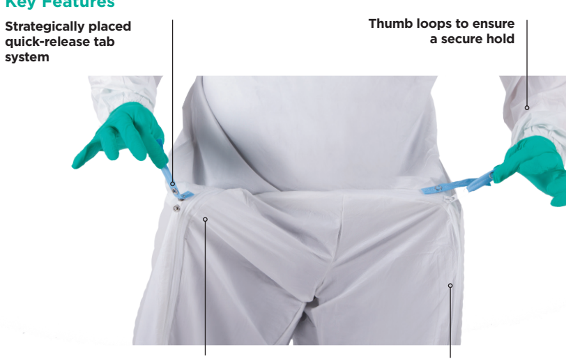
Antistatic low-linting material