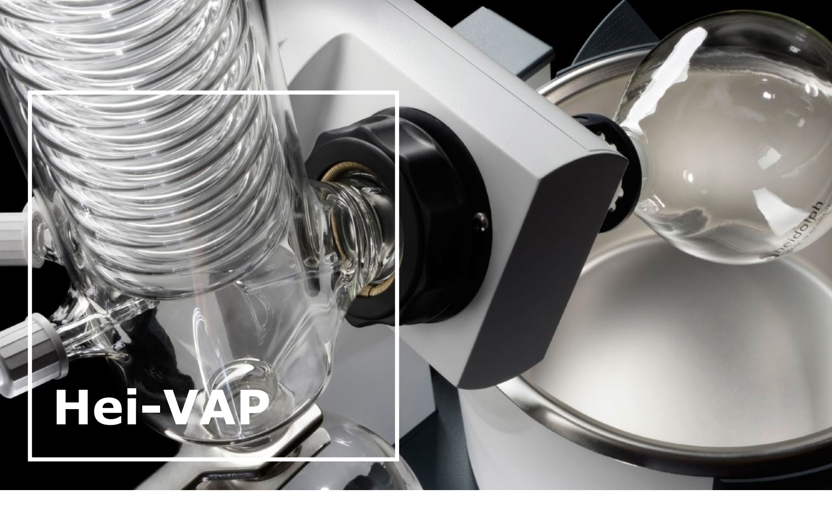
Evap. Vac. Chill.