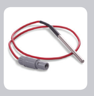
Optional PT 1000 temperature probe

Ordering Information and Specifications*