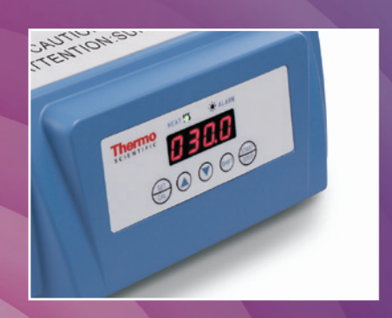
Digital Dry Bath / Block Heater pg 3

Reliability you can depend on. Thermo Scientific™ versatile dry baths / block heaters offer a wide range of blocks to accommodate various tubes. Available with digital or touch screen controls, our units provide outstanding temperature uniformity and stability that help create the reproducible results that you need.