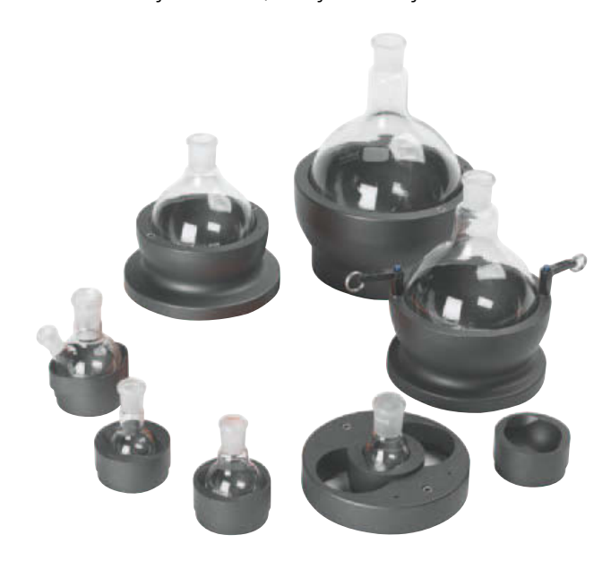
Heat-On – Replace messy oil baths and heating mantles; avoid spills and make your chemistry safer, cleaner and faster...

Test results show that Heat-On heats up to 66% faster and uses 30% less energy than other leading brands of blocks. mple(s) immediately after operation, the optional lifting handles allow you to do so, safely and easily.