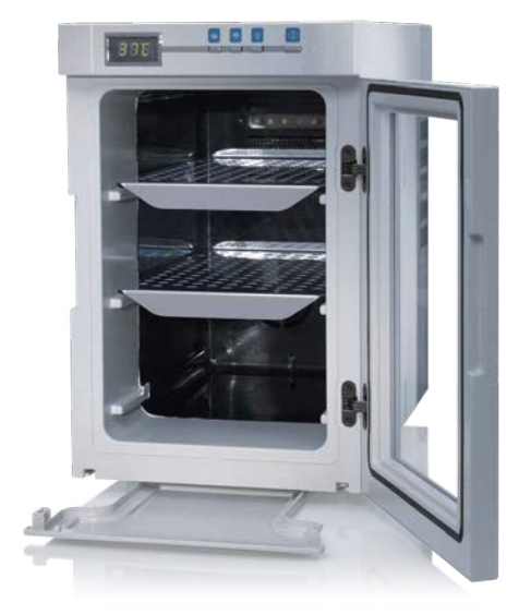
Heratherm Compact microbiological incubator, 18 L