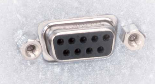
RS232 standard on all General Protocol, Advanced Protocol and Advanced Protocol Security models/sizes

Heratherm incubators offer exceptional data monitoring systems that provide the key to reliable results.