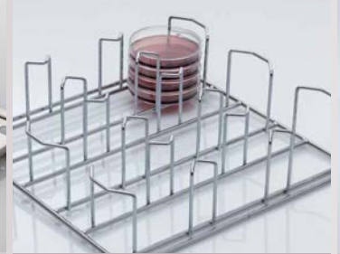
Petri dish holder