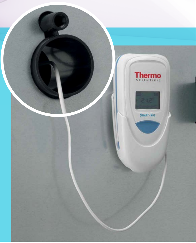
Rear view of the 100 L Advanced Protocol incubator with Smart-Vue

Solutions vary by RF regions worldwide and are compatible with multiple brands and types of laboratory equipment. Contact your local sales representative for more details.