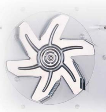
Two speed fan for matching the airflow to your application