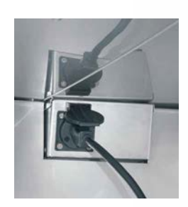
Heratherm Advanced Protocol incubators with internal socket for connection of electrical device (e.g. stirrer / shaker)