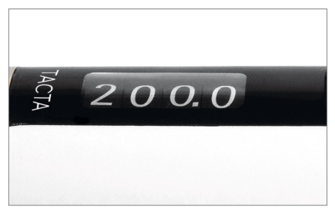
The volume is easy to read even when the pipette is angled.

The large, easy-to-read display helps you to see all four digits of the set volume from a distance without straining your eyes. The volume is easy to read even when the pipette is angled – eliminating the need to turn your head into an uncomfortable position.