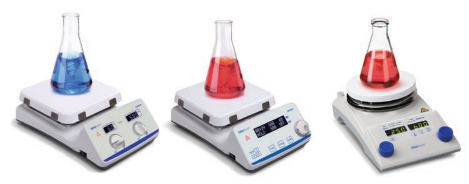
(L-R) Isotemp, Isotemp Advanced, Isotemp RT Advanced series

With a wide variety of features and options, the Isotemp Series, Isotemp Advanced Series, and Isotemp RT series of hotplates, stirrers, and stirring hotplates support all your applications – from basic stirring needs to the most precise high-temperature heating and control. Improve your process. Customize your workflow.