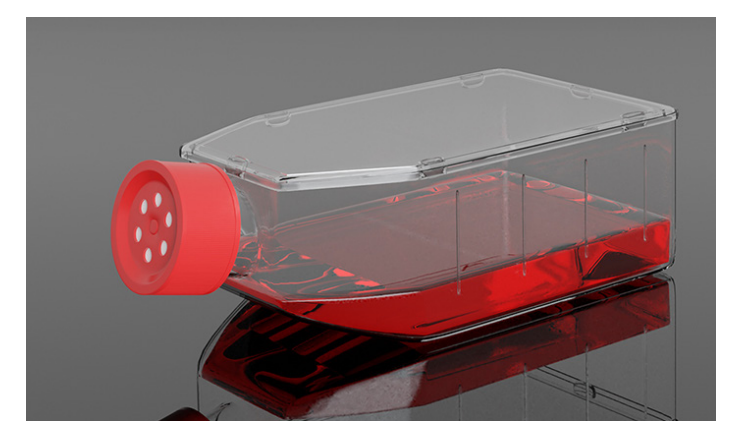
Browse Proteins | bio-techne.com/reagents/proteins

Our purification and production standards ensure we achieve high levels of bioactivity and purity, and lot-to-lot consistency. In addition, we manufacture GMP-grade proteins that come with extensive documentation to provide cell therapy researchers with a consistent, fully transparent, and traceable source of reagents.