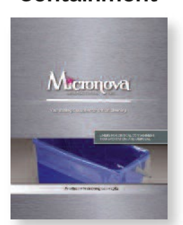
Click Here to view mini catalog