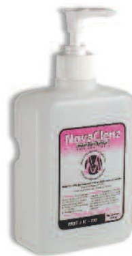
NovaClenz® Ethanol Gel Hand Sanitizer