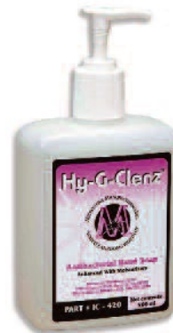
Hy-G-Clenz™ Antiseptic hand soap with persistent activity