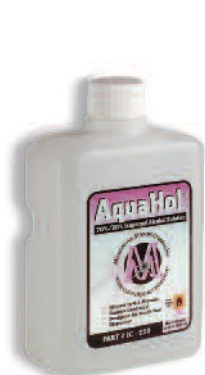
AquaHol™ Sterile Alcohol Sanitizer