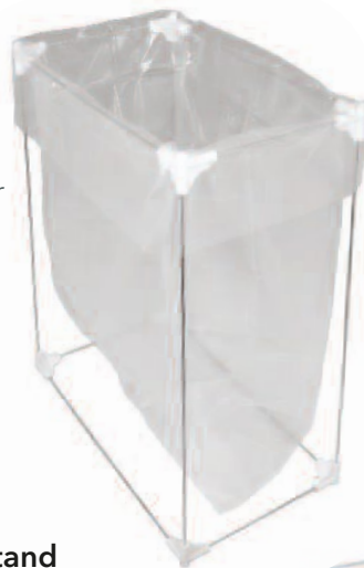
LDPE BinLiner in Stainless Steel BinLiner Stand