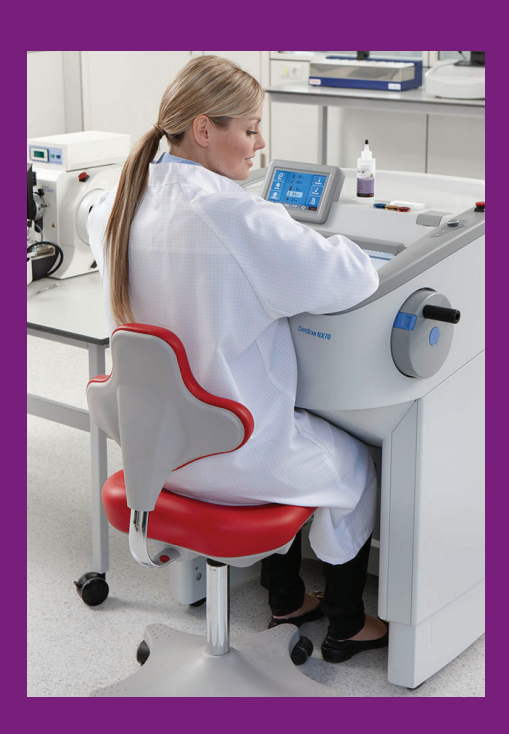
Motorized height adjustment for seated or standing operation (standard for NX70, optional for NX50 models)