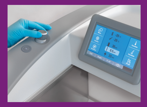
NX70 cryostats feature motorized sectioning for ease of use and to reduce the need for repetitive motions