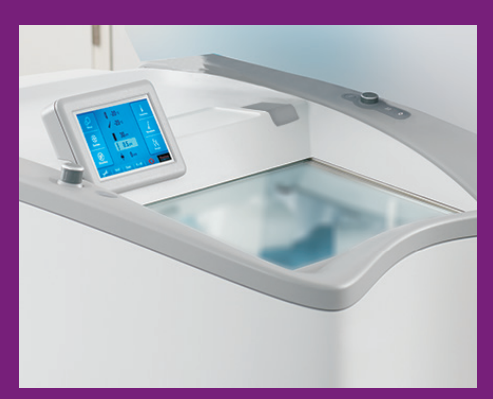
Optional cold disinfection system for NX50 and NX70 cryostats