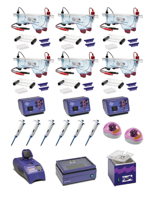
Cat. #5067 Classroom PCR LabStation™ Supports up to 25 students!

Cat. #534 Piccolo Microcentrifuge Variable speed from 0-6,400 rpm